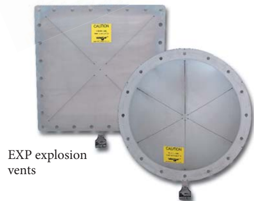
EXP explosion vents