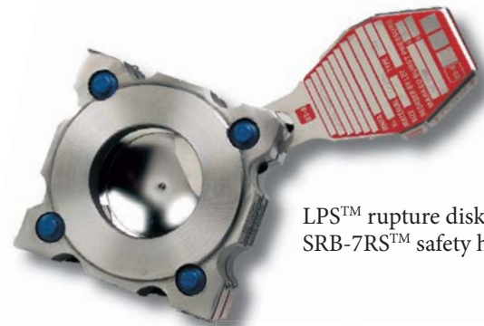
LPS™ rupture disk and SRB-7RS™ safety head